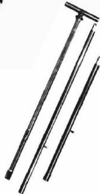
E15 -Basic 6' Unit E13 -4' Extension E14 -6' Extension

USA & CANADA 1-800-445-6611 FAX WATS 1-800-445-6690 www.MillerLightingProducts.com