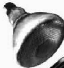
E12 Changer Vac -A Flood Remover