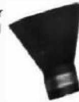
E18 Vac-A-Bulb Replacement Head Only