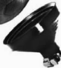
E19 Vac-A-Flood Head only