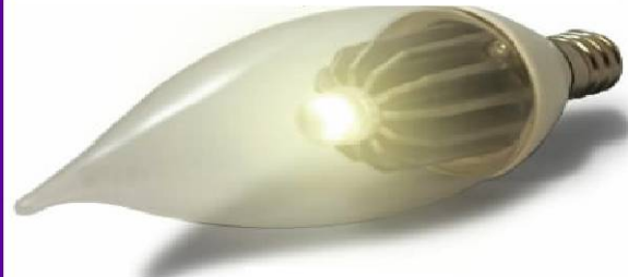
Intensely Bright , True BA10 Bent Tip Replacement

BL22F Frosted, warm white, Bent Tip, BA10 Bulb